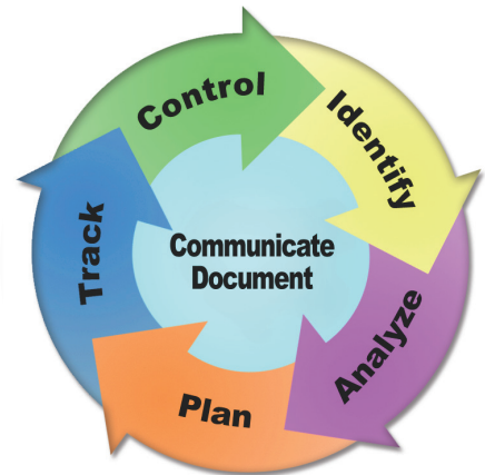
Continuous Risk Management Paradigm

Futron's Risk Management practice provides leading edge decision support consulting services to a diverse array of industries. Our world-class team of analysts, engineers, and risk managers bring unparalleled skills and expertise to each risk management engagement. With professionals located in Bethesda, MD, Hampton, VA, and Houston, TX, Futron has supported a wide variety of mission-critical initiatives at NASA and other highly technical organizations.